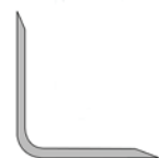
Inside Corner Internal Angle