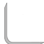
Outside Corner External Angle